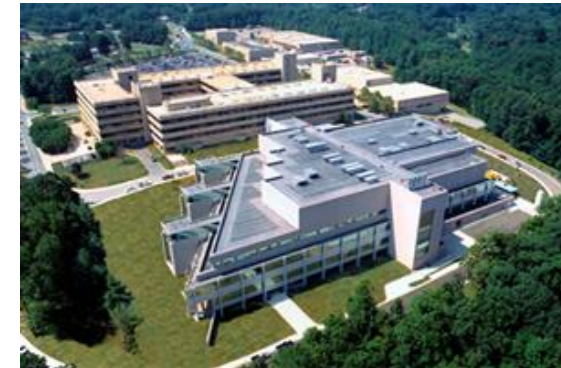
US Army Research Lab - Adelphi