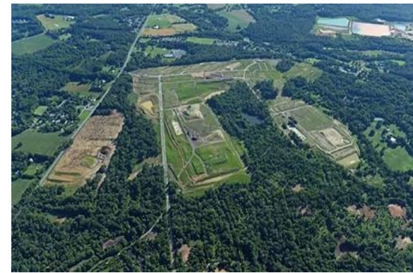
Bainbridge Naval Training Station

St. Mary's County AeroPark Innovation District ~ St. Mary's County