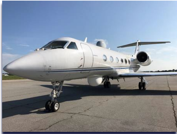
Tailored COCO ISR

AIRtec Inc is a solutions-based company that provides a wide range of aviation services to support various end customers. With an expansive history of providing COCO ISR, Telemetry, Range Surveillance, Maritime Patrol Awareness, and Aircraft Modification services; AIRtec offers tailored services to meet end customer needs and then executes those solutions with an absolute customer centric approach.