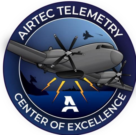
Leading Edge Telemetry